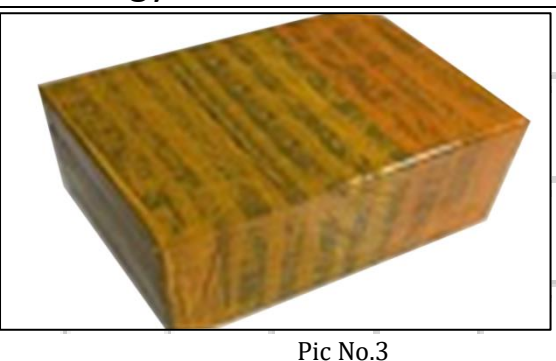
International express packaging: Wrapped with yellow tape after wrapping black protective film