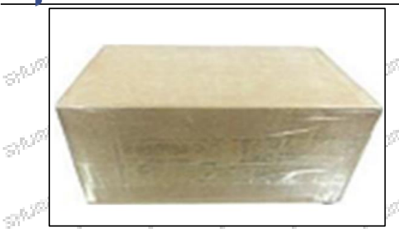
Pic No.2 Domestic express packaging: Wrapped by Transparent tape